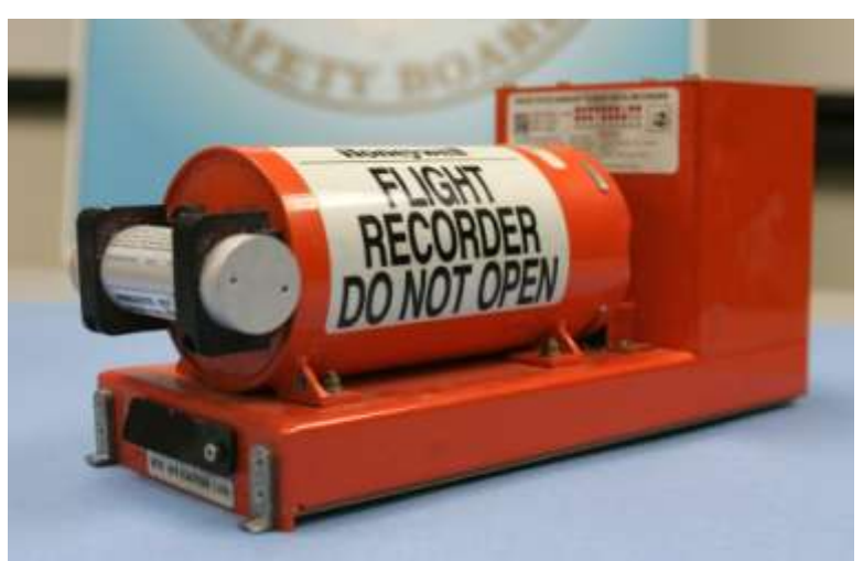
Figure 1.1: A Black Box Found In Airplanes

International Journal of Engineering Research and Development (IJERD) ISSN: 2278-067X Recent trends in Electrical and Electronics & Communication Engineering (Page 01-04) (RTEECE 08th – 09th April 2016)