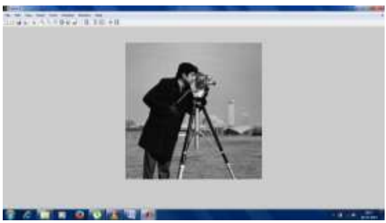
Fig.4 Transformed Image