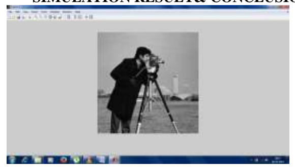
Fig.3 Original Image