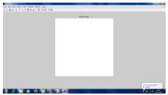
Fig.5 Biterror Image