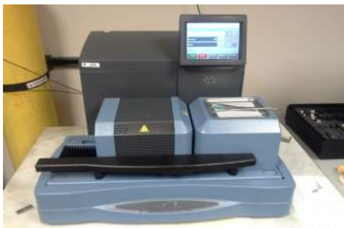
Fig. 1: SDT Q 600 TA instruments, Waters USA.

Instrument- The instrument used is SDT Q 600 TA instruments, Waters USA.