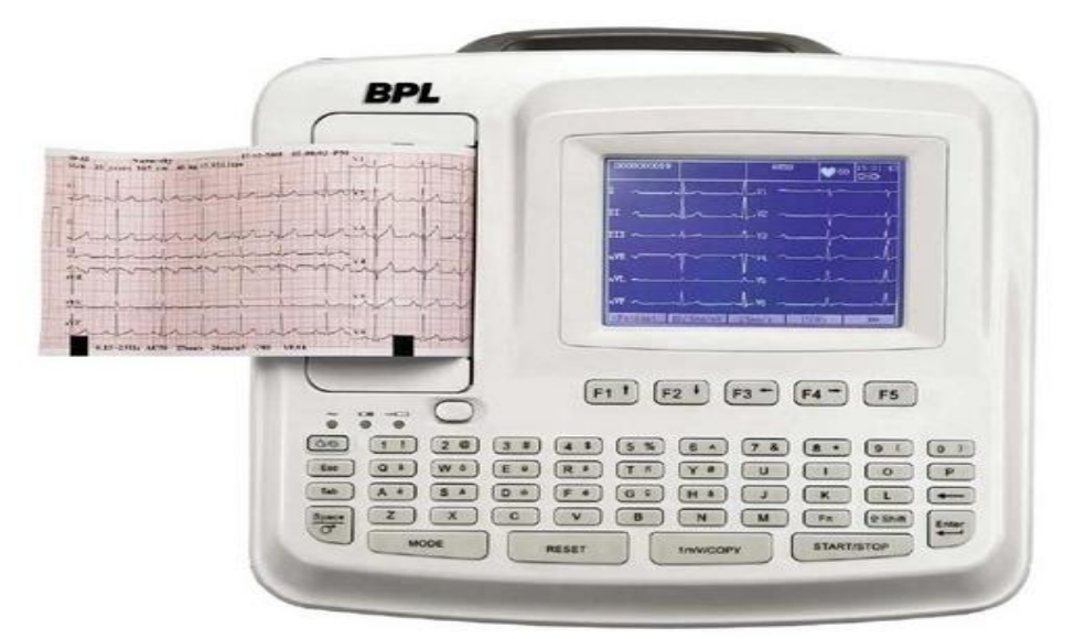
Fig. 2: Traditional ECG machine

Also human intervention is required to read the ECG, the machine itself cannot say if there is any heart anomaly, it just displays the heart's electrical activity. Owing to such restrictions, there is a need for an ECG monitoring system that is more intelligent, a system that works on its own in real time and provides freedom to the patients while they are they are carrying out their daily routine.