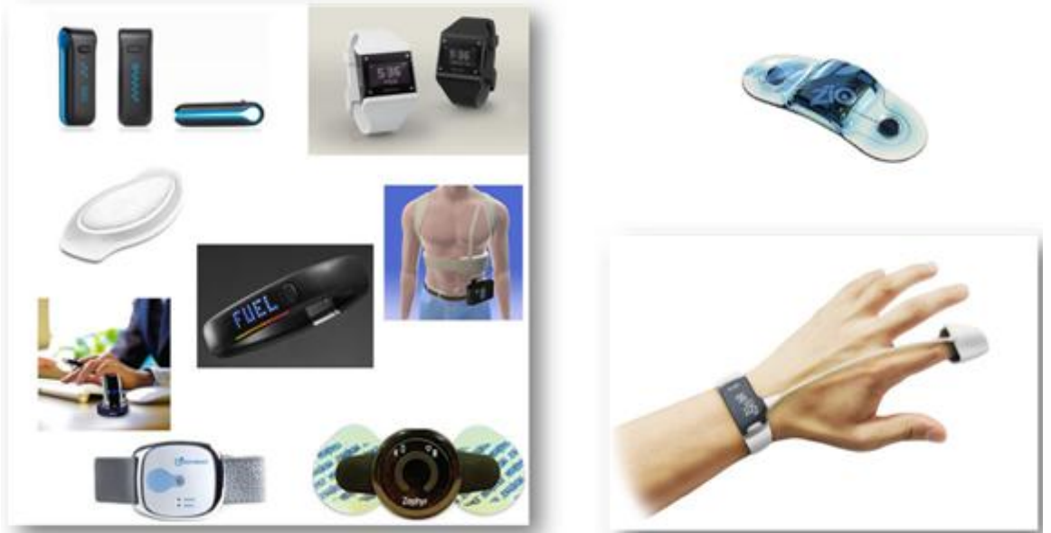
Fig. 3: Wearable devices available in market

8) Zio XT-Patch: Designed by Irhythm company, is a wearable device that monitors hearts electrical activity and sends data to the hospital via a wireless medium. The device records data for fourteen days and sends it to the hospital. Major disadvantage of such a system is that the entire data is accumulated over a period of time and is sent for analysis purposes. Hence the device stores the data over a period of time and does not work on a real time basis.