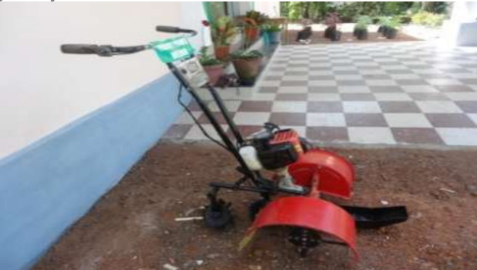
Fig.1: Photographic view of modified power paddy weeder

Power paddy weeder is a manually operated implement powered by 1.75 Hp petrol engine and designed to work in two rows of 20 to 30 cm spacing in wet lands. It works by the rotary motion of blades and the weeds were uprooted and buried in the field itself. A float provided in the front portion prevents the unit from sinking into the puddled soil. At present power paddy weeder works in two rows and modification was done to attach a cono weeder in line with the float of the power paddy weeder so as to cover the weeding in three rows at a time (Fig.1). The float from power weeder as well as float and cone from cono weeder was removed initially. The length of float of conoweeder was increased by attaching a separate MS sheet (4mm) below the float and the unit bolted to the power weeder. A clamp in MS sheet ( 20x6 mm) was made for fixing the cone unit and assembling the unit to the paddy power weeder. The depth of cone and float was modified and handle height was adjusted.