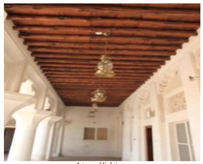
A type of lighting.