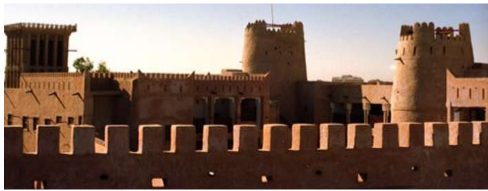
The museum and its surroundings: the contrast whether in terms of texture, height, and even activities.