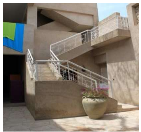
The staircase handrail which is added does not reflect the sense of historical place.