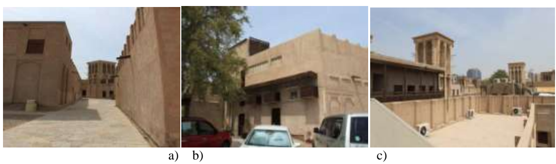
a)The garbage basket does not has any harmony in terms of shape, material with the area.

b) & c) The lighting features which placed on the walls with the hidden A.C do not respect the historical environment.