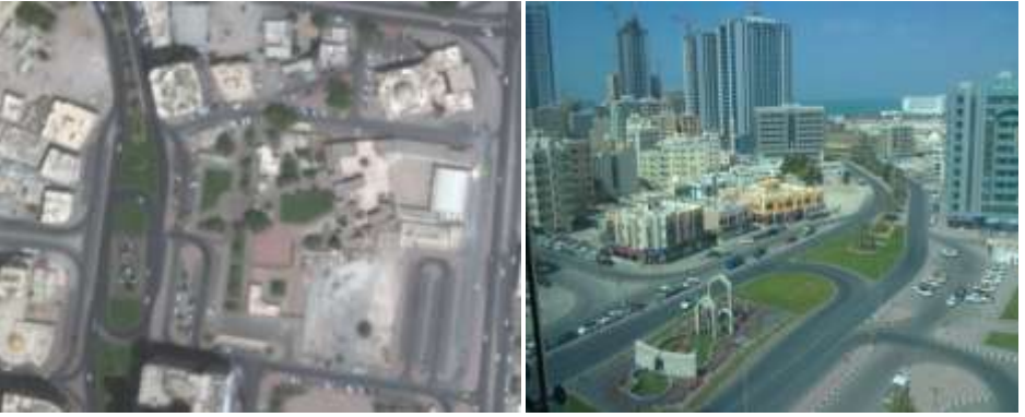
The surroundings of the historic area: the contrast whether in terms of texture, height, and even activities.