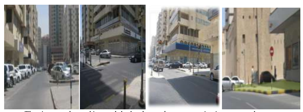
The signage, the parking and the landscape have a negative impacts on the area.