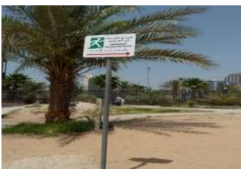
This type of signage can be everywhere like other standard signings without taking this kind of environment into consideration which will reduce the value of this elements. So this have to be done in harmony with the historical area.