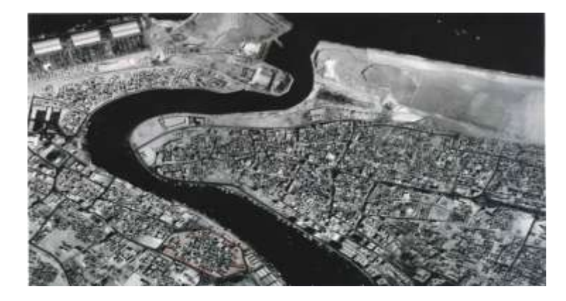
By 1970, Dubai has developed considerably. There is a new deep- water harbor, the Creek has been widened and deepened, and land is being reclaimed, especially on the Deira side. A modern road network is clearly visible, and the Bastakiya is now encircled.