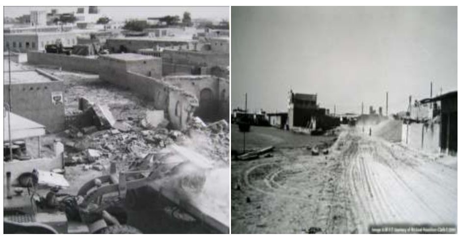
In the 1970's: most of the historic areas were demolished and replaced by the grid for the mechanic circulation and the introduction of new facilities and services.