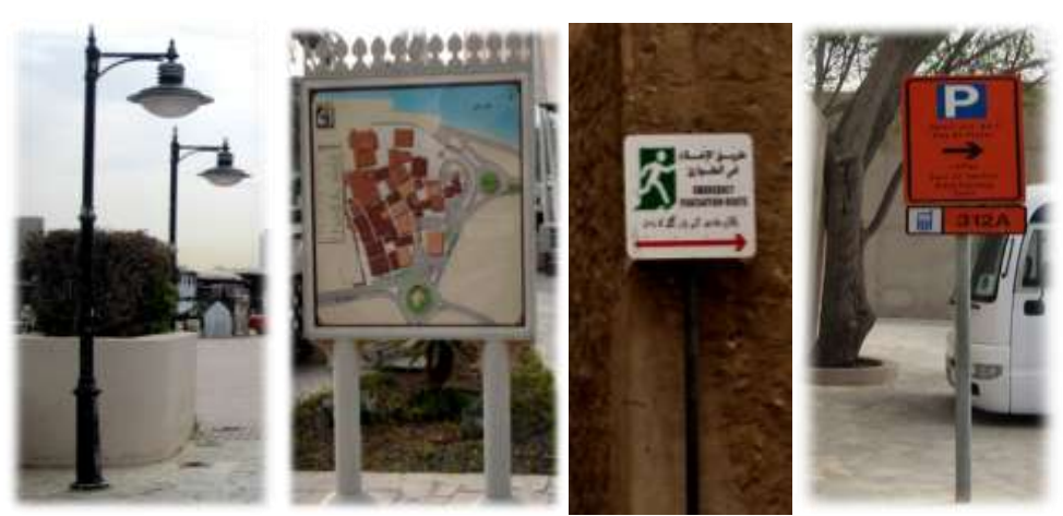
The public lighting and the flags: Small in the size but big in the effect in a way that their location and shapes are reducing from the spirit of heritage area.