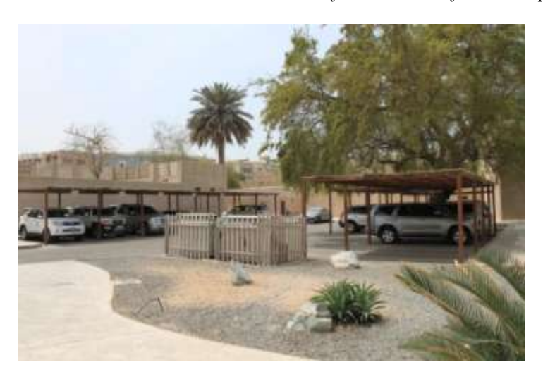
The parking's shading with this kind of structure has no harmony with the area. The asphalt paving, has no unity with the area and the rest old paving areas.