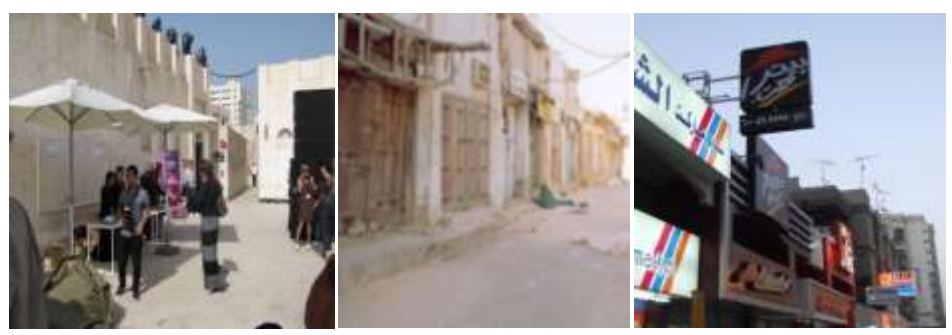
The restoration of the souk had been done on the detriment of the area, we preserve the body (the buildings) but we forgot the spirit) the activities and the users which end up by being developed for touristic purposes and mono-functional.