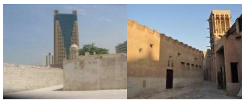
Contrast of scale, in the left side the building is developed at the city scale and imposing itself as a landmark, in the right side the buildings are defining the public space.