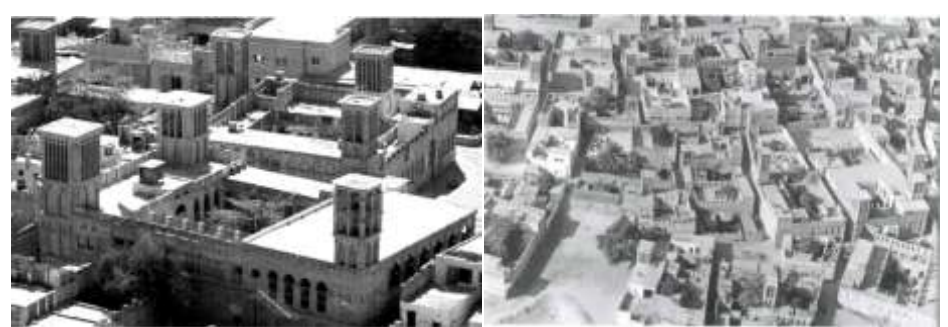
The wind tower, called barajeel, is in every house of Al Bastakiya.

The first masonry houses were built along the Creek edge at the end of the nineteenth century. The largest houses were concentrated in the north-west.