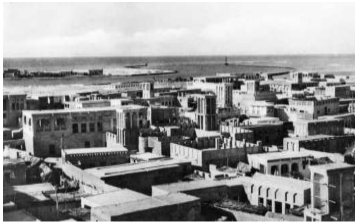
The urban composition where the wind towers are part of the sequential rhythm and composition.