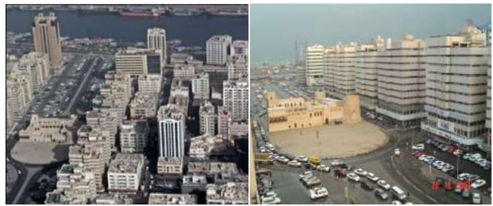
Flagrant contrast between the traditional and the contemporary urban composition whether in terms of height, openings or proportions. Al Hosn is becoming just a roundabout regulating the mechanic circulation.

Post Modern building nearby the historic area. In this intervention there is no respect of the height and the wind towers are added as a part of a décor and we end up by having folkloric architectural production.