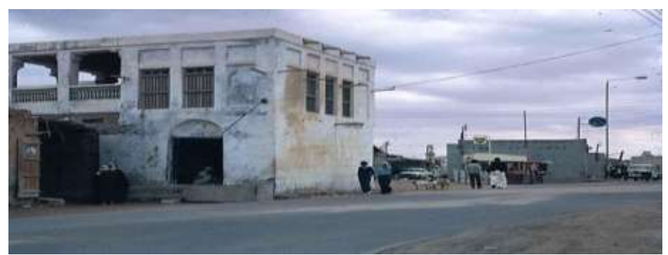
Yousif Bin Naser building double floor called (ghorfa): this building was demolished.