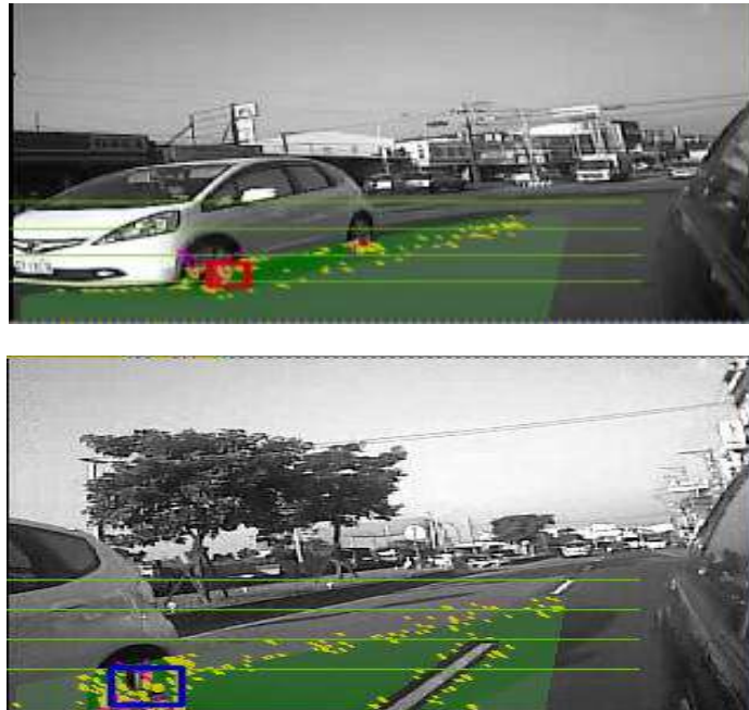
Fig (2): example of side view vehicle

A blind side screen is a vehicle-based sensor gadget that recognizes different vehicles situated to the driver's side and back. Notices can be visual, capable of being heard, vibrating or material. In the event that side perspective mirrors are legitimately balanced in an auto, there is no blind side on the sides. To remunerate the viewpoint impact, the dark levels and edge sizes in all above location criteria are have to be required.