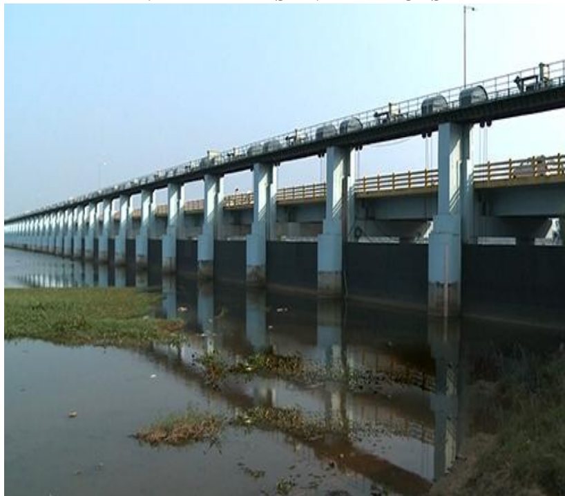
Fig 1. Chamravattom Regulator Cum Bridge