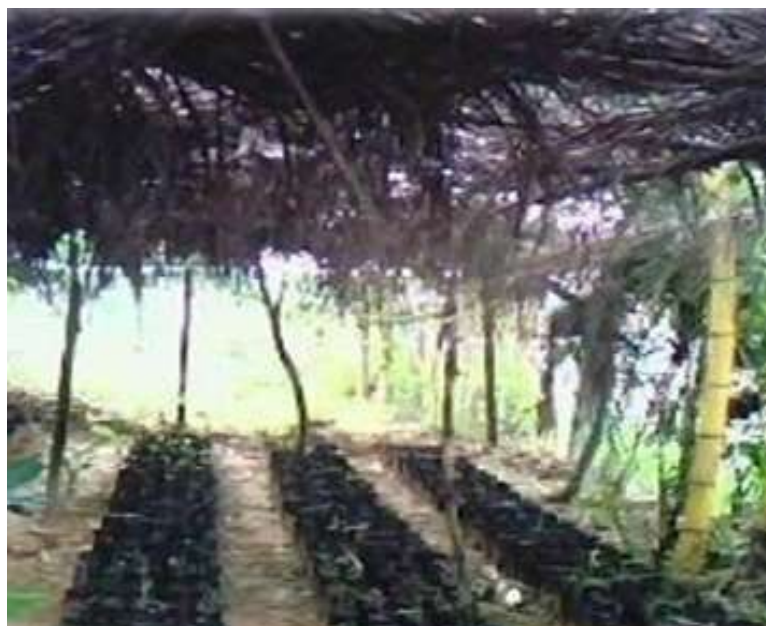
Figure 2. Experimental device for cuttings and germination of T. orientalis