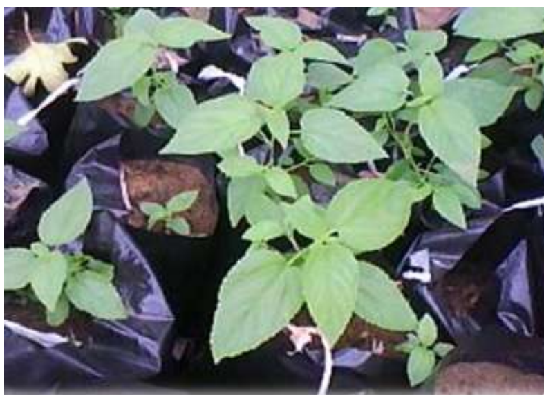
Figure 3. Seedlings of T. orientalis in nursery

Thus, the test on the emergence and cuttings was carried out as a whole on 1840 pockets without fertilization. Observations during this phase concerned the emergence and recovery of material from different trees located in three different places, notably Kisenso, Lemba and N'djili communes for five weeks. The seeds were previously dried in the sun for two days and stored in porous envelopes before sowing for about one week in a relatively ventilated room. All the seeds were sown the same day, but the cuttings were planted after a one-week lag. The cuttings harvested each time during the evening were stored in a relatively humid place before the establishment carried out each morning. The dimensions used for cuttings are about one centimeter in diameter and a length equivalent to four knots. The temperature reading that the entire germination and recovery period characterizes, was carried out at a frequency of three times a day, ie seven hours, twelve hours and seventeen hours (Figure 4). The mother trees on which the seeds and cuttings harvested, were geo-localized and characterized by their DHP, crown height and surface crowns.