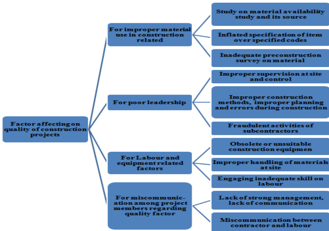
Figure 1 (b): Integrated Framework for Assessing Factors Affecting quality management in infrastructure projects