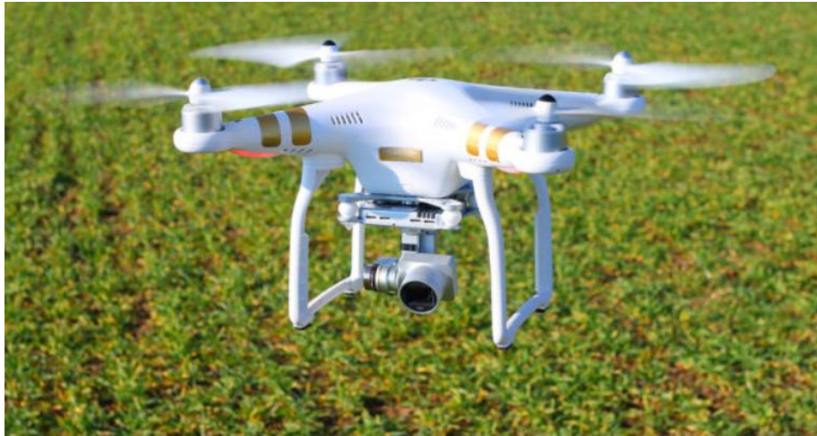
A typical image of an UAV or a drone in Indian agriculture.