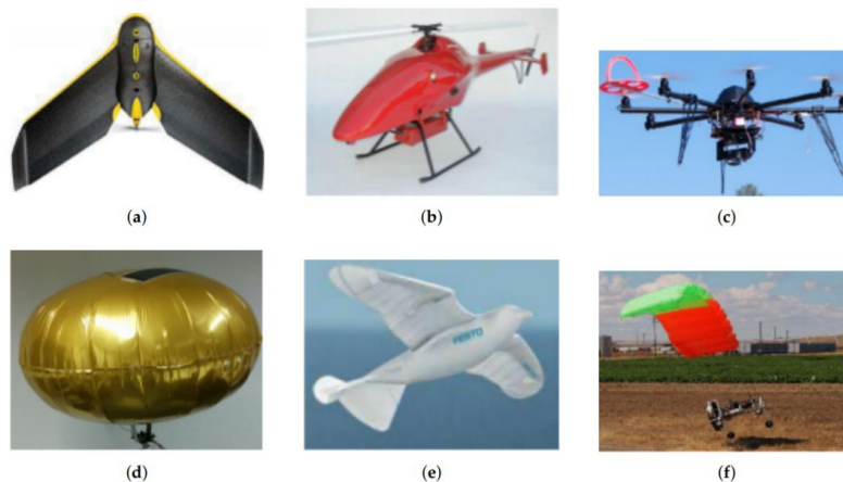
Figure 1: (a) Fixed wing (eBee) (b) helicopter (Hornet Maxi) (c) octocopter (d) blimp e) flapping-wing (SmartBird) (f) parafoil-wing (Tetracam)

Focusing on the UAV technologies being used for Precision Agriculture (PA), the types of Unmanned Aerial Vehicles can be divided into five basic categories, based on their design characteristics (see Figure 1) [Tsouros et al, 2019]