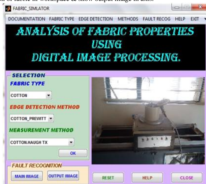
Fig 2: User Interface for Application