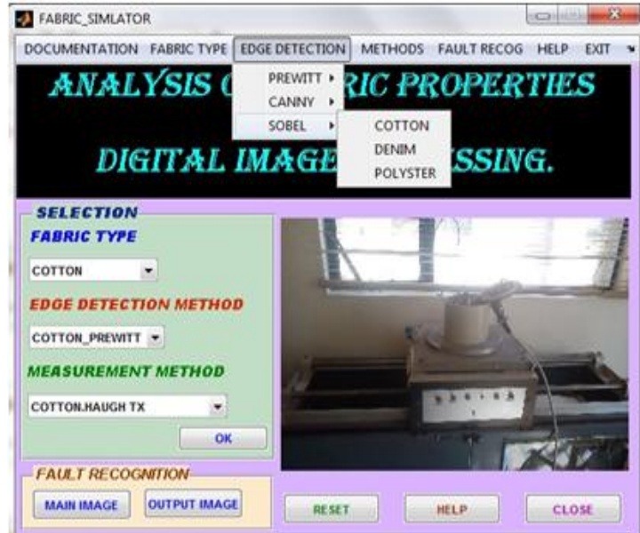
Fig 4: GUI showing canny edge detection results for cotton

Fig 3 shows the snap shot of fabric simulator when we can select the different edge detection technique for the fabric from edger detection menu. Digital fabric simulator have different menu in menu bar, Such as documentation, fabric type, edge detection, methods, fault recognition, help, exit. It can also select denim, polyester. We can also select the edge detection operation performed on cotton fabric result. In fabric simulator select canny, sobel, prewitt method in edge detection method for different fabric. This fabric simulator have a menu editor through which it can be used the different documentation facility available regarding fabrics and its properties. It also provides the online help as one can require it.