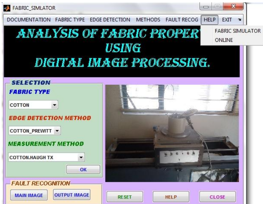
Fig 5: GUI showing the facility of online Help

Digital Fabric Simulator provides the online help as one can require it. To get the help about the operation of fabric simulator user can get it by selection of help menu available in it and user can also get the online help about it for its fundamental by selecting online help from the help menu bar. Fig 5 shows the snapshot of the help menu in Digital fabric simulator.