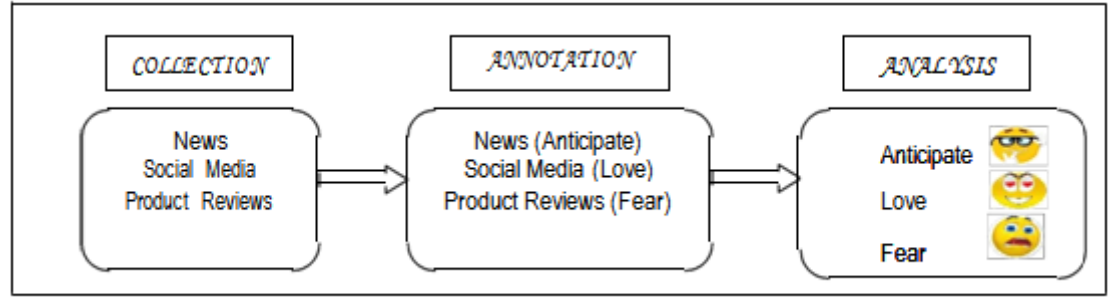
Figure 1: Phases of a corpus

A corpus is developed by three main steps: collection, annotation and analysis. In Fig: 1 . the phases of a corpus are revealed. Each of them is strongly inclined by the others. The analysis and exploitation of a corpus can reveal limits of the annotation.