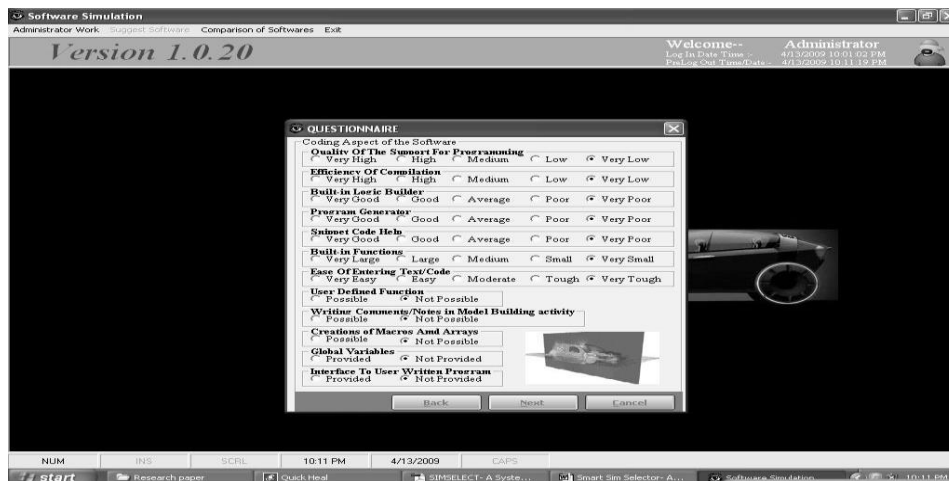
Figure 2: Screen for adding new software in Smart Sim Selector database.

Administrator can add, delete and modify any software in the database. Also the option 'Details of the Softwares' will display the details of all the softwares contained in the database to the user and administrator. Once the administrator selects to add new software, the screen as shown in Figure 2 will be displayed.