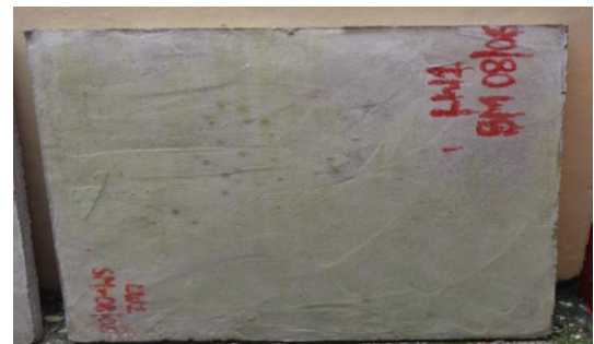
Fig.2: Finished wall panel placed for curing