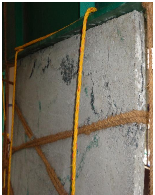
Fig.6: Crack pattern in slab with double layers of wire mesh

During testing it was observed that the wall panel failed due to compression. For 25mm thick wall panel the failure occurred at the center, but the wall panel was whole together by the mesh reinforcement. In case of 50mm thick wall panel the failure occurred at the end surface only. Hence with increase in thickness of wall panel we can increase the performance of ferrocement wall panel.