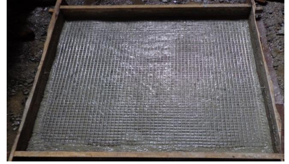
Fig.1: Casting of Wall panel

Mould for casting wall panels was made out of timber. For casting wall panels, the mould was placed on a flat surface and water was sprinkled on the base in order to reduce the water absorption. For casting of wall panels with single layer of steel mesh, a first layer of mortar was placed up to half the thickness required. Then the steel mesh was placed over the first layer. The last layer of mortar was placed over the steel mesh, so that the mesh was sandwiched in between the mortar layers.