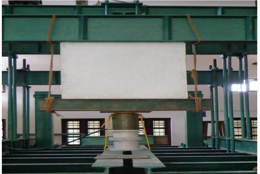
Fig.3: Wall panel placed on loading frame for testing

The specimens casted were tested for their failure load using loading frame of capacity 100 tons after 28 days. For testing of wall panels, hydraulic jack of 50T capacity was used. Load applied was measured using a dial gauge with 0.1T accuracy.