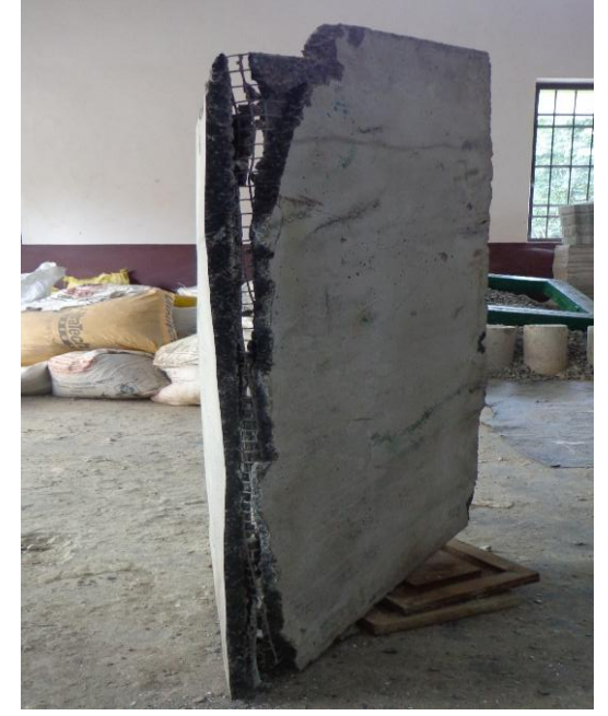
Fig.5: Crack pattern in slab with single layer of wire mesh

Failure pattern after testing is as shown in Fig.5 & Fig.6 for wall panel of 25mm and 50mm with single layer wire mesh respectively.