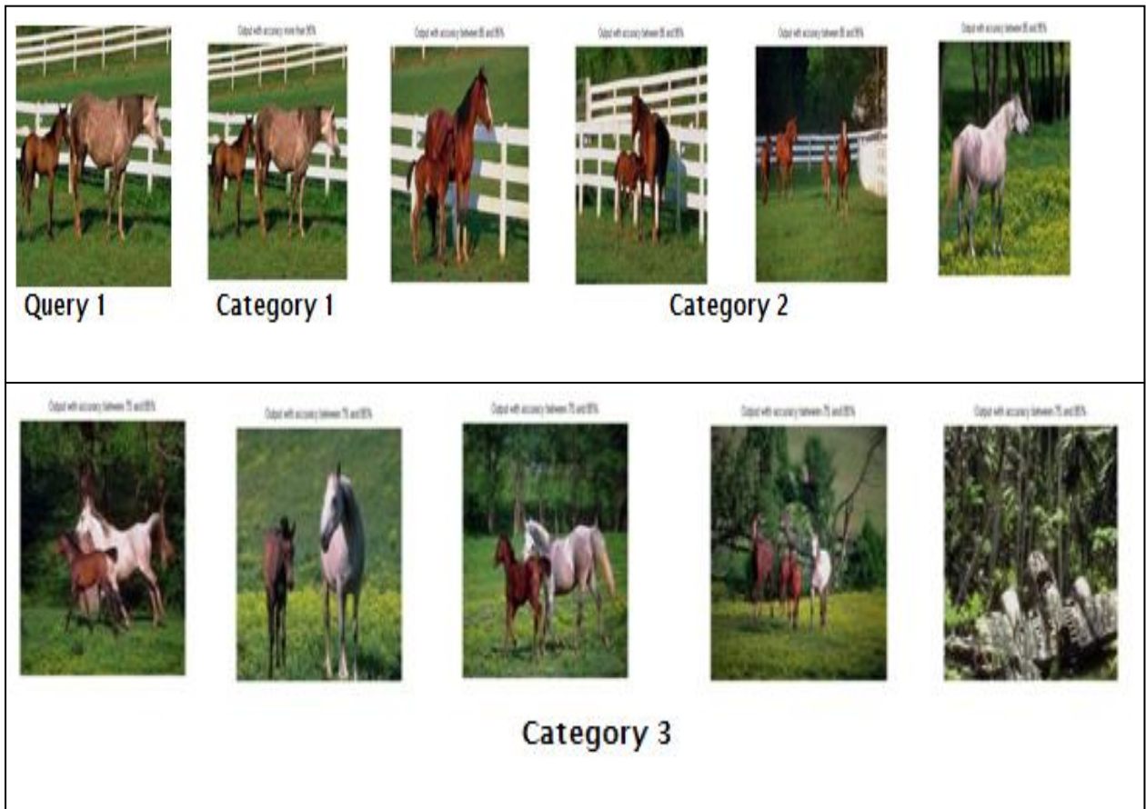
Figure 3: Results

These 3 categories of the results provide user an extra feature of choosing the results between particular accuracy levels. The results for different Query images are obtained as shown below in Figure 3.