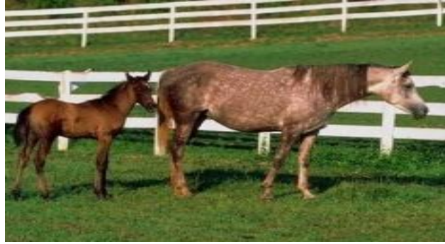
Figure 2: Query Image

The results are displayed in 3 different categories;