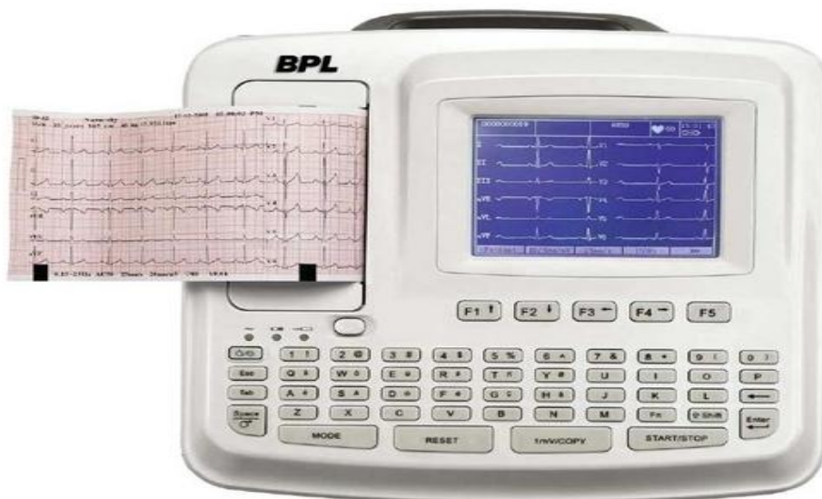
Fig. 2: Traditional ECG machine

Also human intervention is required to read the ECG, the machine itself cannot say if there is any heart anomaly, it just displays the heart's electrical activity. Owing to such restrictions, there is a need for an ECG monitoring system that is more intelligent, a system that works on its own in real time and provides freedom to the patients while they are they are carrying out their daily routine.