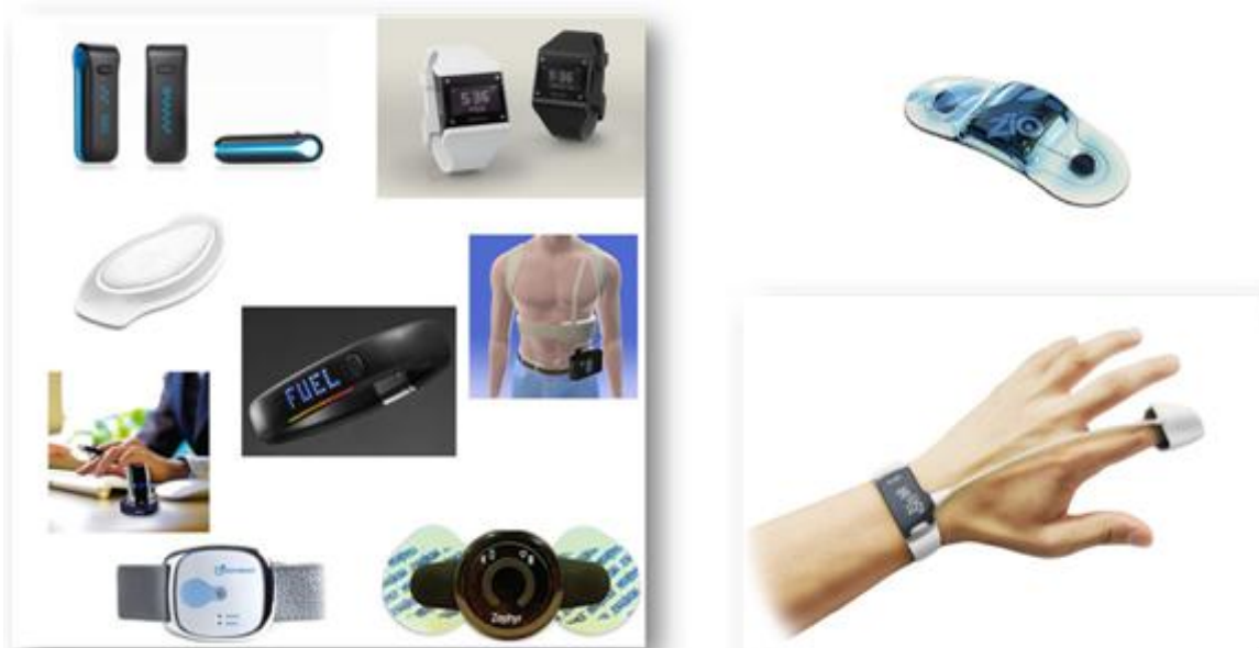
Fig. 3: Wearable devices available in market