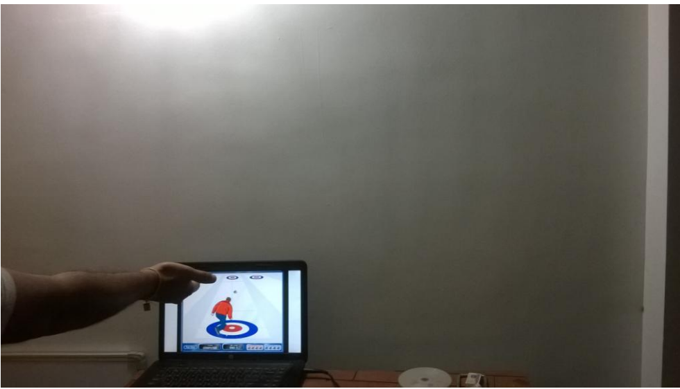
Fig. 3: Demonstrates curling game using gestures

Some games like skating and water surfing which involved more of a mouse based moves were easier to implement and control and the position was tracked close to 90% of the times. Users need not have to go out to skating stadium or skate on road; they could have a simulation of the same at their home and could get a more realistic feeling of skating. Figures (4) demonstrate the same.