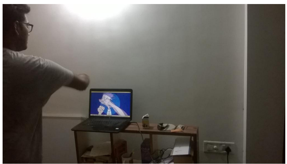
Fig. 1: Demonstrates the boxing game using hand gestures

It was noted that for games like boxing and bowling which involve just the movement of the hands, the accuracy was close to 95%. Figures (1-3) demonstrate some users playing a game of boxing and bowling. Here more emphasis is laid on the increase and decrease of the area, movement of the centroid, position in 3d space of just the palm