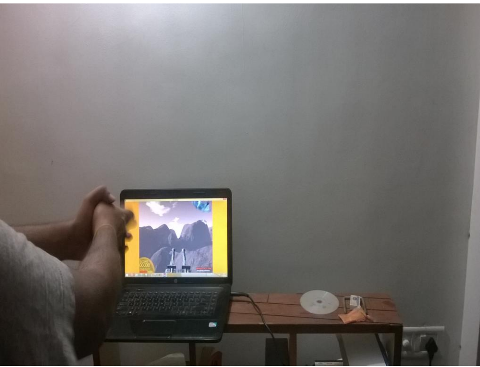
Fig. 7: Shows a gesture based shooting game