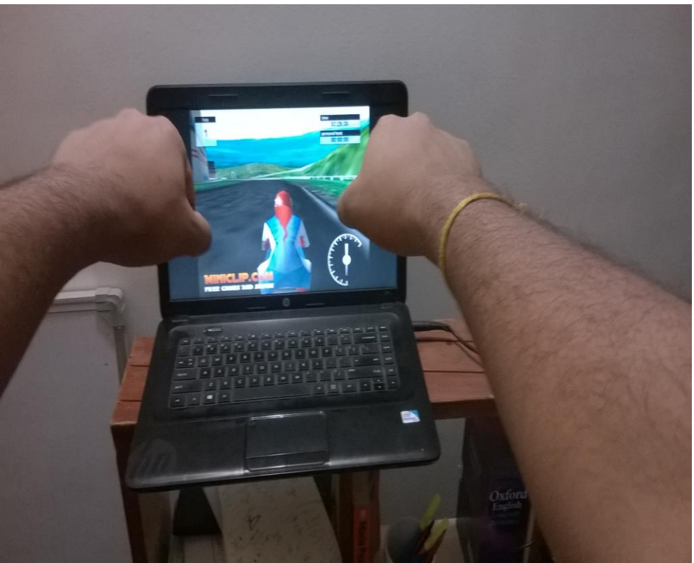
Fig. 6: Demonstrates the user playing a bike racing game

Shooting games have forever fascinated gamers around the world. Developing an interface to detect the tilt and pointing gestures of the hand is a very difficult task on an ordinary web camera. Here we basically employ a technique where both the fair and dark portions of the right hand is tracked. An increase in one area results in the decrease of the other area. The place where it is pointing to is basically determined by the skeletal model of the hand. Figure (7) demonstrate an sample shooting game played using gestures. The processor has to be really fast to determine the orientation angle, pointing position and shooting actions from the user. The results were close to 85%.