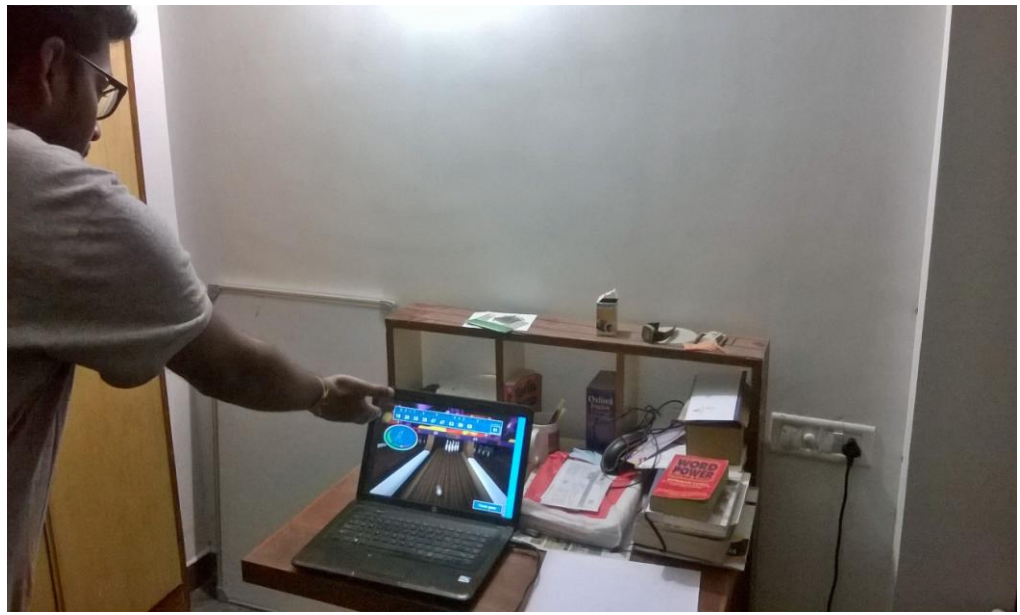
Fig. 2: Demonstrates bowling game using gestures