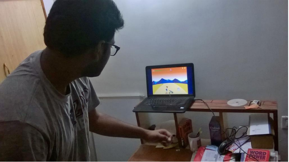
Fig. 4: Demonstrates skating using bodily gestures

Some games like skating and water surfing which involved more of a mouse based moves were easier to implement and control and the position was tracked close to 90% of the times. Users need not have to go out to skating stadium or skate on road; they could have a simulation of the same at their home and could get a more realistic feeling of skating. Figures (4) demonstrate the same.