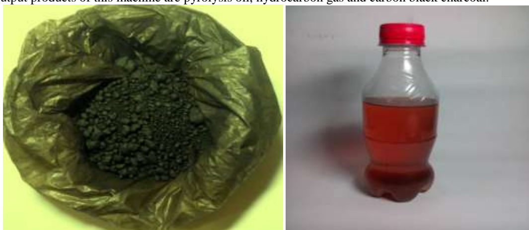
Fig.4. Carbon black charcoal and pyrolysis oil extracted as a output of machine.

The output products of this machine are pyrolysis oil, hydrocarbon gas and carbon black charcoal.