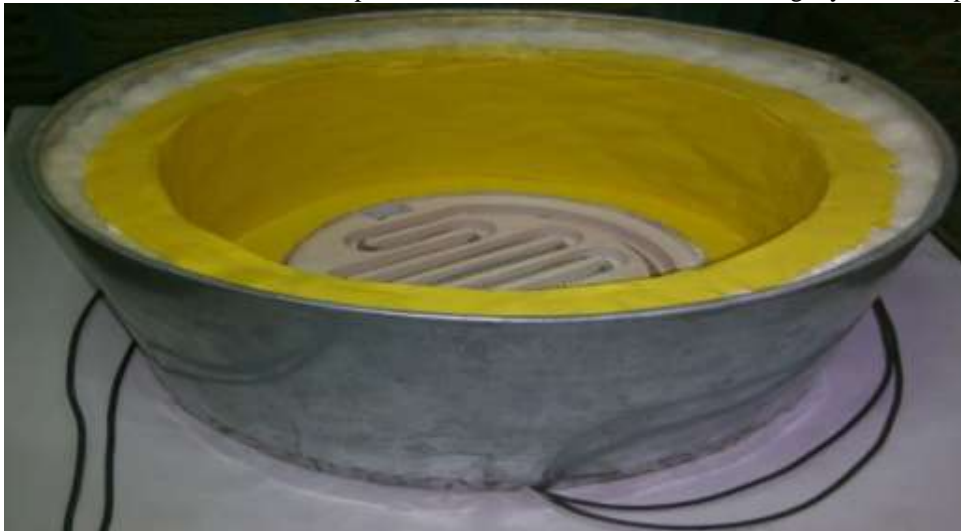
Fig.3. Side view of furnace (demonstrative prototype model).

INSULATING MATERIALS- In order to provide insulation two different insulating layers are employed.