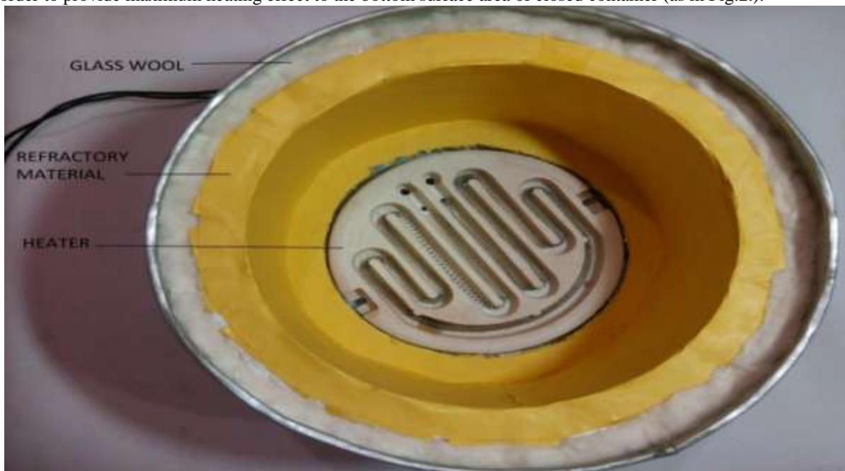
Fig.2. Top view of furnace (demonstrative prototype model).

TEMPERATURE CONTROLLING ELECTRIC HEATER - This electric heater is employed for maintaining the temperature between 400 to 450 degree Celsius of the furnace. It is also one of the safety measures in order to prevent overheating of the container. Electric heater is fitted at the bottom of furnace in order to provide maximum heating effect to the bottom surface area of closed container (as in Fig.2.).