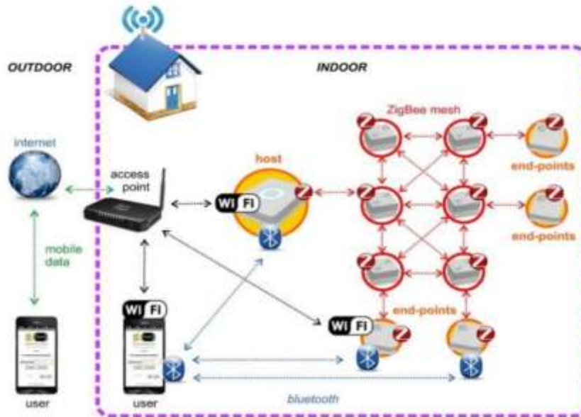
Figure1. The system architecture of the proposed

Outdoor environment designed for mobility purposes, so that the user can monitor any device in the home that is connected to the WSN system, anytime and anywhere. Therefore, the smart-phone or gadget needs to be connected to the internet-cloud. Access point bridge will manage every device on WSN system that should connect to the internet-cloud, with a particular IP address. With this scheme, the user can monitor and control any device in the intelligent home system that is connected to the system, anytime and anywhere. The proposed architectural illustration Detailed presented in Figure 1.