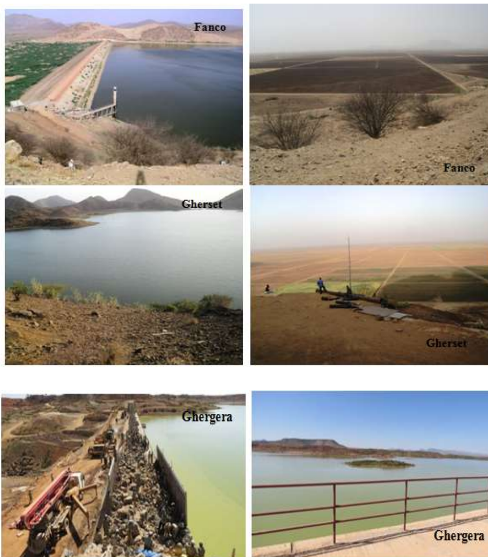
Fig. 2: Recently constructed and on-going multi-purpose dams

To satisfy the demand on water, the natural supply of several rivers is regulated through storage reservoirs created by the dams built across the tributaries of these rivers. Accordingly, the government has been constructing big, medium and small storage infrastructure for different purposes [12]. There were about 187 dams (Table 2) with a capacity of over 50,000 m 3 each as has been mentioned in the introductory section. The total capacity of the dams reached 94 × 10 6 m 3 in 1998. In the last decade or so, a number of medium and big