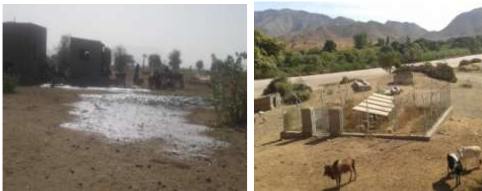
Fig. 4: Mismanagement of water systems