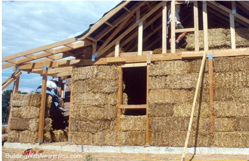
Figure 3: Straw-Bale House [3]

Deep overhangs and trellises provide shade in the summer to minimize cooling costs. The only place where the natural gas is used in the house is in the kitchen (for cooking). While straw walls are north and west oriented, the south wall of wooden frame has a lot of windows bringing natural light in the living quarters. Abundant natural light, LED lighting, and energy-efficient appliances let keep energy consumption to a minimum. Hot water is produced with a heat pump. Solar panels on the roof can compensate for power consumption. Using rammed earth as a building material is one of the most ancient techniques (Fig. 4).