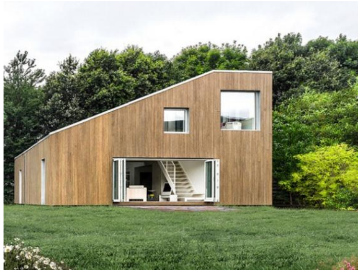
Figure 1: An example of a two-storey building made of shipping containers [1]

In this case, two containers are placed on the sides for a higher common space in the building. The bedrooms are placed inside the containers, while the entrance, dining room, living room and attic are located in the center of the structure. The eco-house is not connected to the power line, using solar orientation, passive cooling, green roofs, furnace heating, and solar panels to create electricity. Fig. 2 shows an eco-house built from shipping containers in San Jose (Costa Rica). Such house construction was dedicated to provide spectacular views of the natural landscape (large transparent windows used for this purpose). The roof between the two containers is made of scrap metal.