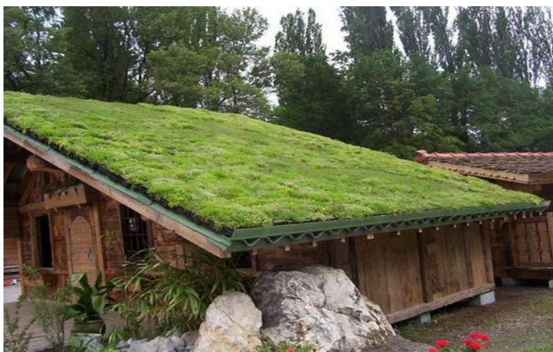
Figure 5: Example of a green roof [4]

holding heat better than the glass fiber. Painting roofs white is the easiest way of heat reflection and saving on costs in the summer. But an even better option is to plant greenery on rooftops. Roof gardens help insulate the building in winter and absorb rainwater in summer, reducing water pollution in urban runoff (Fig. 5).