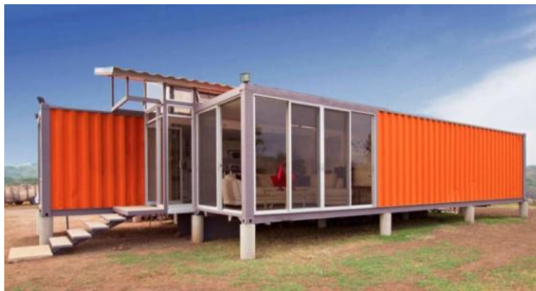
Figure 2: Eco-house built from shipping containers in San Jose (Costa Rica) [2]

In this case, two containers are placed on the sides for a higher common space in the building. The bedrooms are placed inside the containers, while the entrance, dining room, living room and attic are located in the center of the structure. The eco-house is not connected to the power line, using solar orientation, passive cooling, green roofs, furnace heating, and solar panels to create electricity. Fig. 2 shows an eco-house built from shipping containers in San Jose (Costa Rica). Such house construction was dedicated to provide spectacular views of the natural landscape (large transparent windows used for this purpose). The roof between the two containers is made of scrap metal.