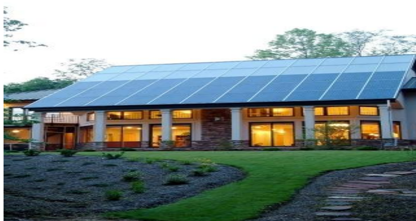
Figure 6: An example of using passive solar energy for heating and lighting of an apartment house [5]

The plants can be used to control the flow of rainwater, and the ground can be used to produce heat. As with wind and solar energy, geothermal energy is an efficient source of renewable energy, which is much more environmentally friendly than coal or gas. Pipes, buried several meters underground, avoiding the effects of temperature change. The temperature of the earth even in the winter period remains at 15oC, making it a warm source of energy in winter and a source of coolness in the summer. Water / antifreeze mixture is pumped through pipes under the ground to collect the thermal energy and is then directed to a heat pump and used for heating or cooling a residential building. Green building is primarily associated with the proper use of passive solar energy for heating and lighting of a house. Large windows may fill the house with heat and air vents can help spread the warm air throughout the room. An example of using passive solar energy for heating and lighting of an apartment house is shown in (Fig. 6).