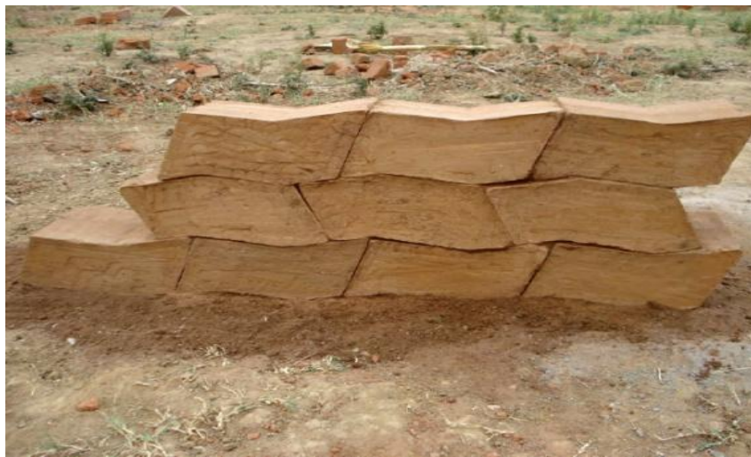
Figure 4: Earthen building blocks [3]

Deep overhangs and trellises provide shade in the summer to minimize cooling costs. The only place where the natural gas is used in the house is in the kitchen (for cooking). While straw walls are north and west oriented, the south wall of wooden frame has a lot of windows bringing natural light in the living quarters. Abundant natural light, LED lighting, and energy-efficient appliances let keep energy consumption to a minimum. Hot water is produced with a heat pump. Solar panels on the roof can compensate for power consumption. Using rammed earth as a building material is one of the most ancient techniques (Fig. 4).