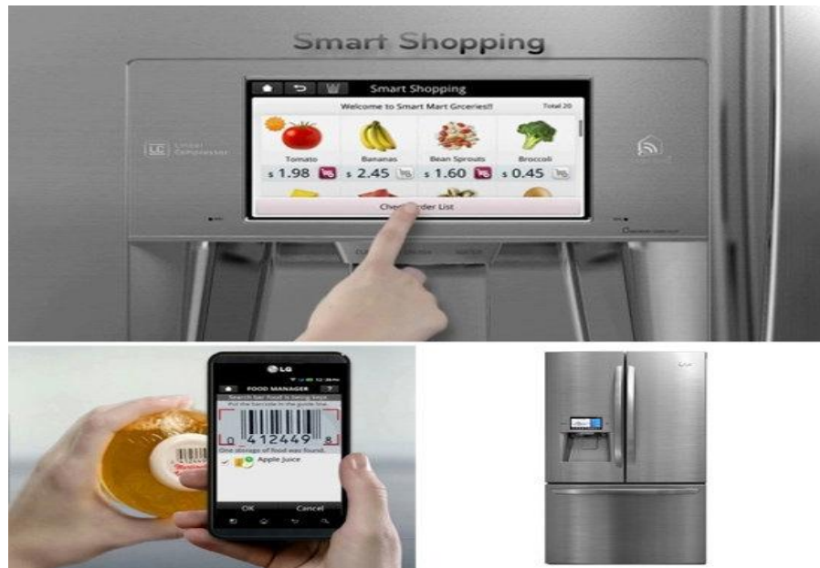
Figure 9: Dyssekilde eco-village [8]

view to successfully operate independently of the usual power line. In other words, they provide consumers with their own energy through renewable energy sources. The value of "zero" threshold applies to both energy consumption and carbon dioxide emissions: such buildings consume a small amount of energy during the year and do not produce emissions of carbon dioxide, as they use renewable energy sources such as solar or wind energy. Houses with zero energy consumption (also called passive houses) are specially constructed so as to be extremely energy efficient, from a variety of insulation materials and using modern methods of construction, such as passive solar design. These projects use complete solutions: wind and solar collectors are sometimes combined with heating with biofuels. The construction of buildings with zero energy consumption is most effective in small towns where a few houses can benefit from a common renewable source, for example, like in the Dyssekilde eco-settlement in Denmark. This eco-village consists of 74 unique blocks of flats, which vary according to the type from the hobbit style thatched houses to the most modern buildings (Fig. 9).