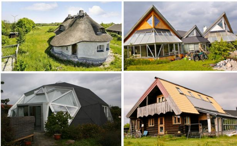
Figure 8: LG Smart refrigerator [7]

The opportunities to reduce energy consumption are largely related to the use of modern household appliances with a greater degree of energy efficiency. Modern refrigerators, washing machines and dishwashers include smart meters collecting data in real time and able to share it with different devices for a more efficient use of energy. For example, LG's smart appliances can determine current energy rate and start automatically when it is cheaper. Modern refrigerator can keep track of the product expiry and notify you by smartphone which of the products you lack by constantly updating your list of products in a mobile application (Fig. 8).