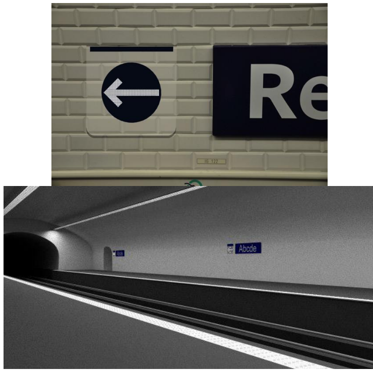
Fig. 4 New signs and displays indicating the name of the station.