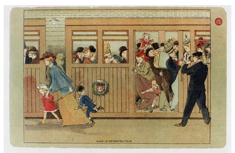
Fig. 1 Dans le métropolitain... on court pour une place - The rush for a seat in the Paris metro (c. 1900).