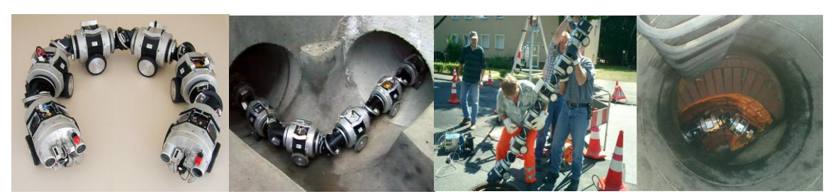
Fig. 6 The service robot MARKO plus during the examination of the rainfall canals

The body segments contain two batteries for energy supply, a RC 104 computer, two symmetric heads and two connections for the operation elements. The PC 104 module enables robot to move self-willed. The ball joint has three variation rates and is placed between the drives. A highly integrated electronics uses a digital signal of the processor which controls an engine and gives exact angle calculations.