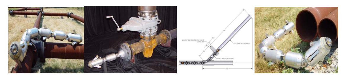
Fig. 5 Application of the service robot Explorer-II [8,11]

The service robots Explorer-II are practical for control of all kinds of pipelines due to its ability to move easy through the pipeline, and also possess flexibility for the pipelines under an angle, like it is shown at figure 5.