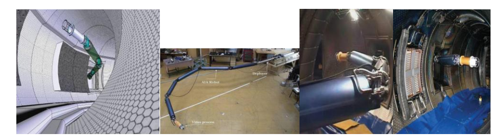
Fig. 3 The service robot-snakelike for examination and maintaining of the facilities under a high pressure and temperatures [8]

The service robots for examination and maintaining of the systems under a high pressure and high temperatures where human presence is not possible are developed; an example of such robot has been given at figure 3.