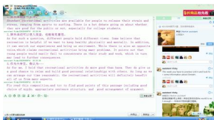
Fig. 2: The pre-exam assistance in how to write high-quality CET-4 composition.